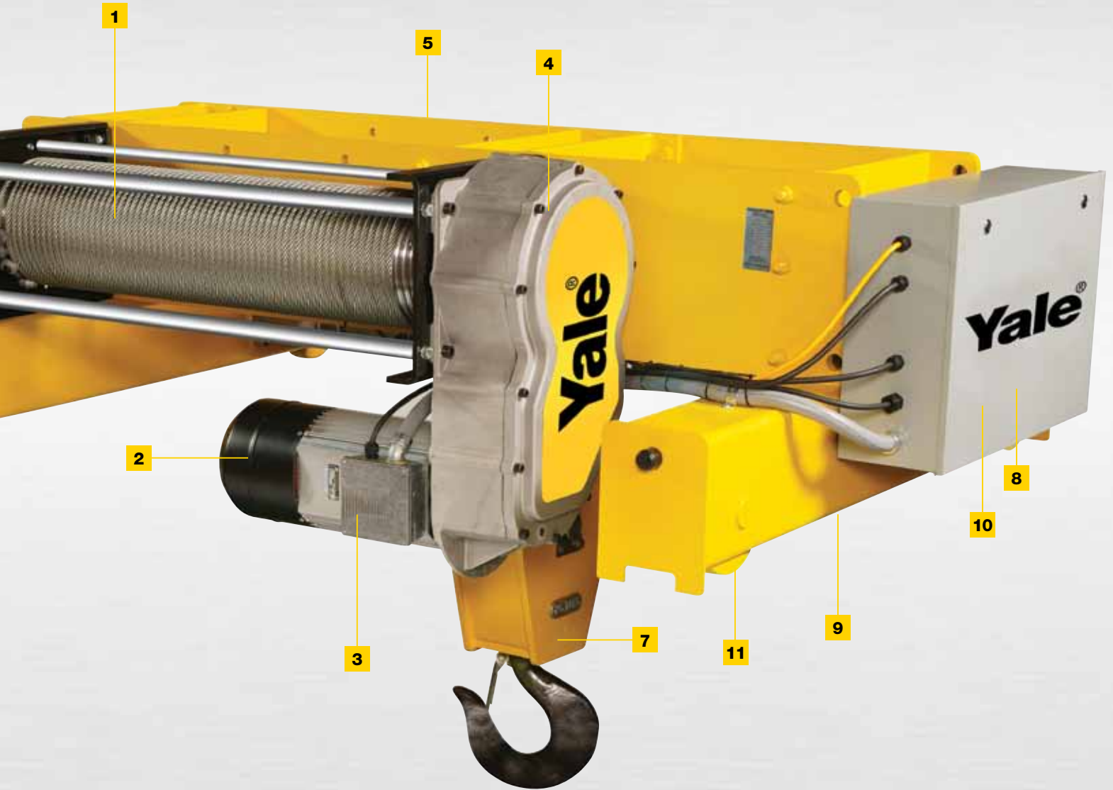
Top-Running Unit Shown Above