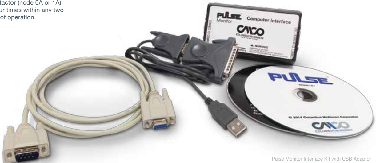
Pulse Monitor Interface Kit with USB Adaptor

For every motor event, the voltage will be measured.